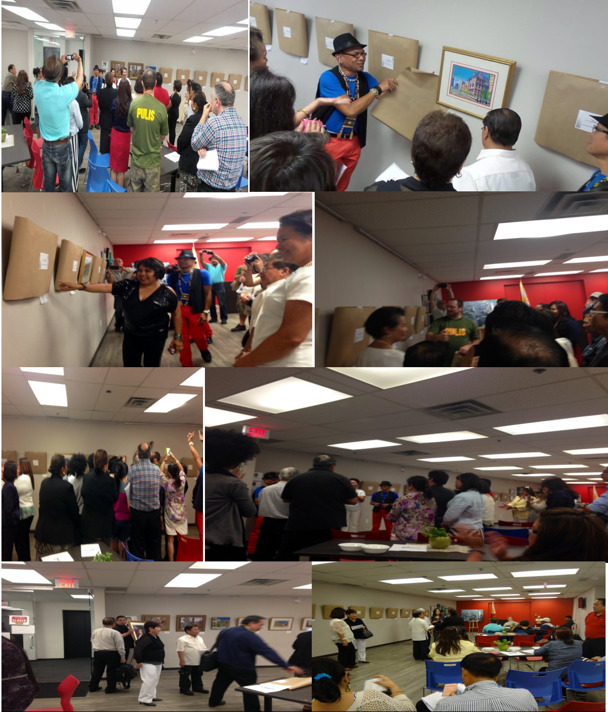
The highlight of the art exhibition was the “guessing game” ( Saanito? ) where invitees were requested to identify the streets or landmarks depicted in the paintings before these were unveiled and presented to the guests. Most of the paintings of Messrs. Masalunga and Afafe in oil, ink, watercolor and acrylic were mounted in century-old frames auctioned by the famous Fairmont Royal York Hotel in Toronto. San ‘to will be on show for two months.