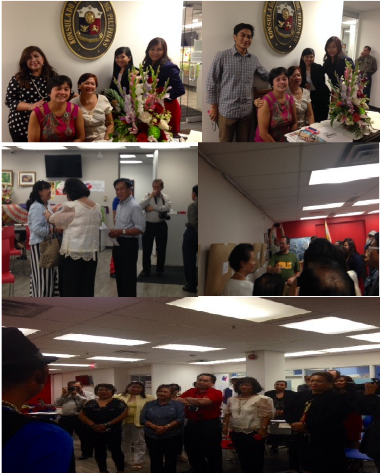
PCG staff (above photo) at the reception desk during the opening of San' to' Art Exhibit at the Philippine Consulate General premises. Filipino-Canadians of different groupings, art enthusiasts and students, and members of press corps in Ontario attended and graced the August 28 th opening of the art exhibit of famous street corners in the city of Toronto.